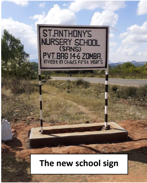
The new school sign