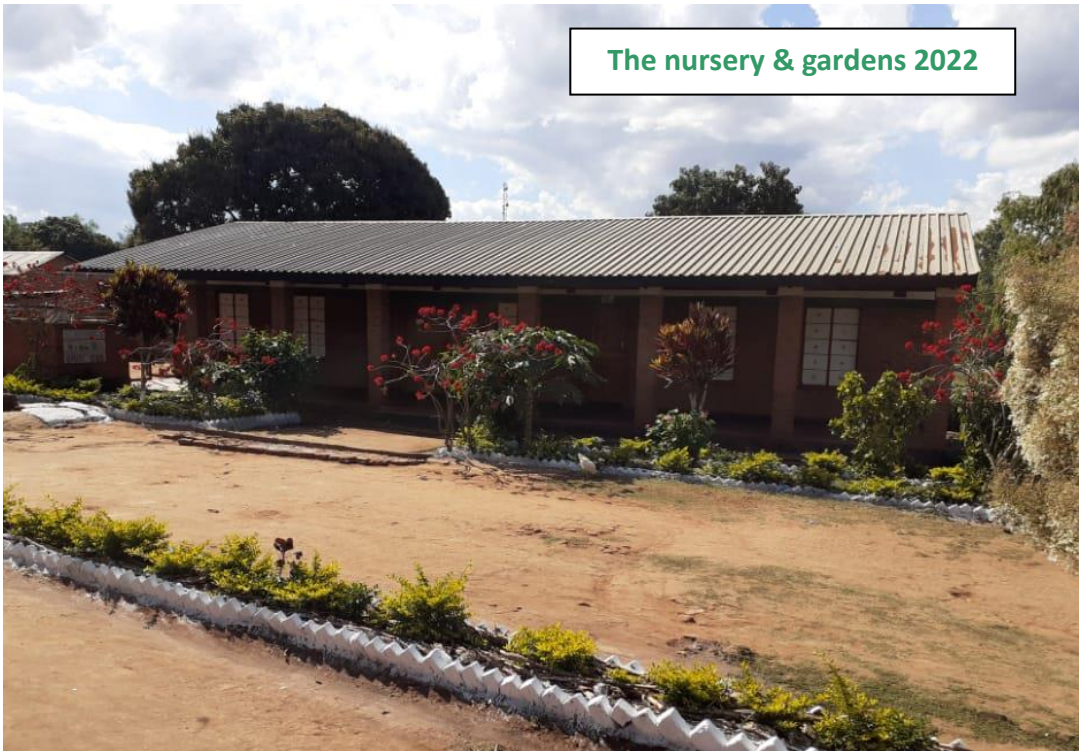
The nursery & gardens 2022