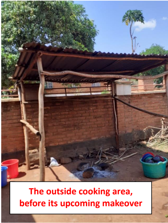
The outside cooking area, before its upcoming makeover