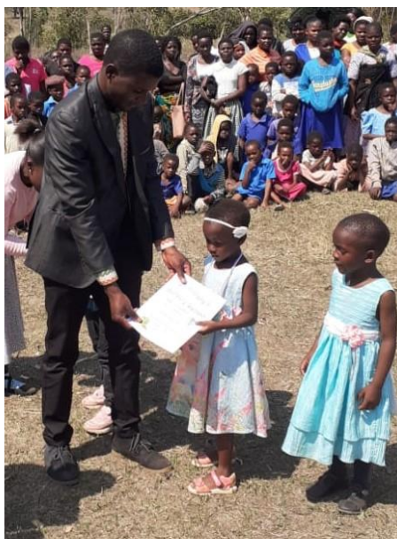
The children of 2022