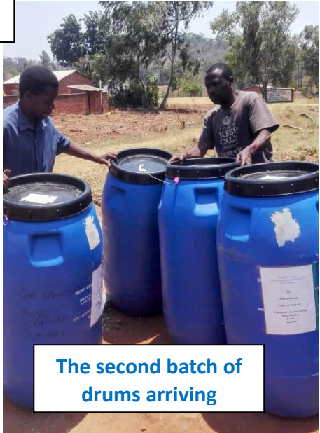
The second batch of drums arriving