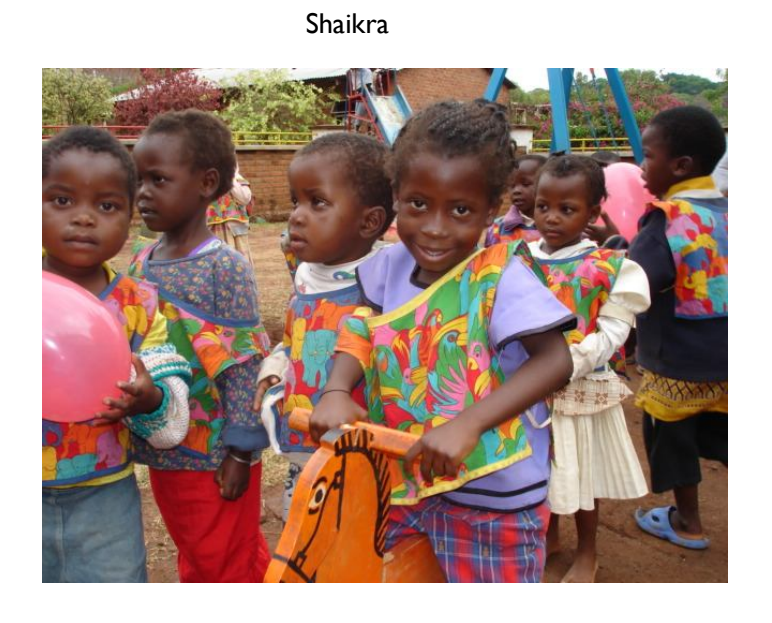
Class A in action