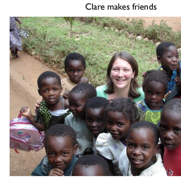
The team 2007